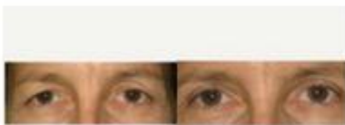
55-64 year old woman treated with Eyelid Surgery