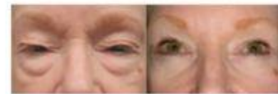
Upper and lower blepharoplasty and mid-face lift