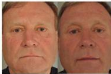
Upper Lid Blepharoplasty