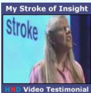
HND Video Testimonial